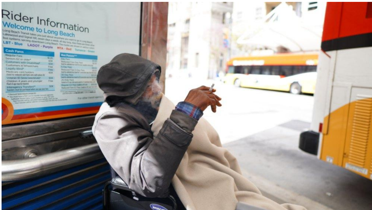
He asked me for the bus direction while he was resting. Taken in the Bus Station in Downtown Long beach.