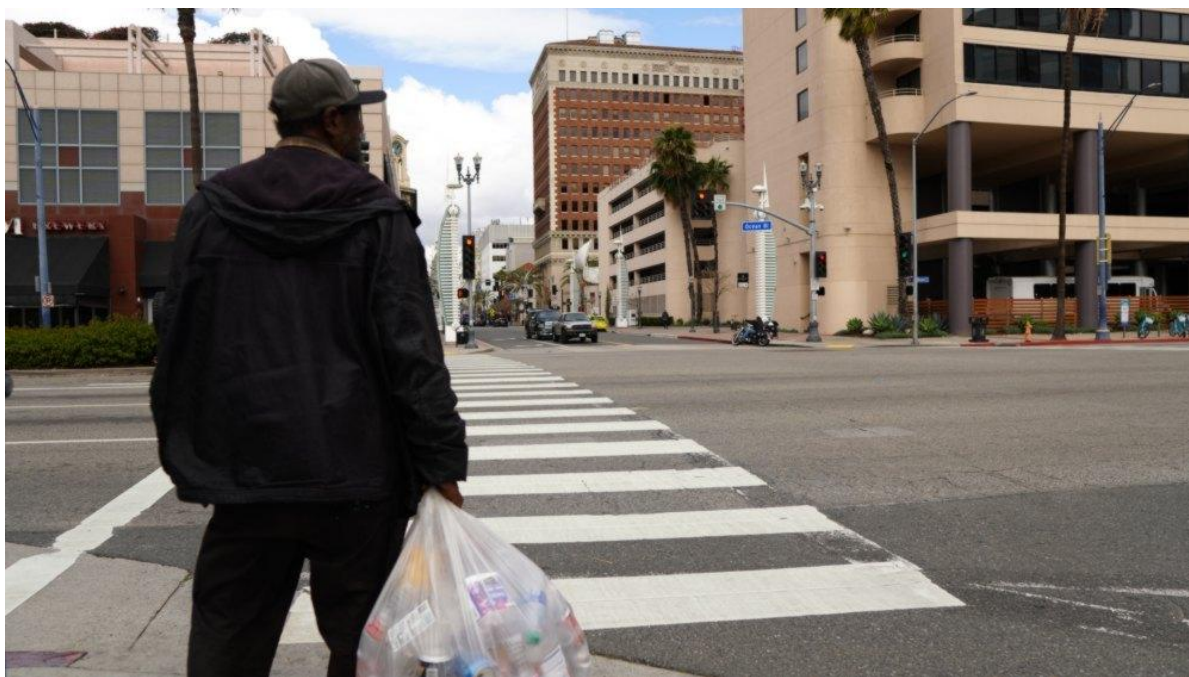
A man after a round of hunting bottles for recycling. Taken near The Pike.