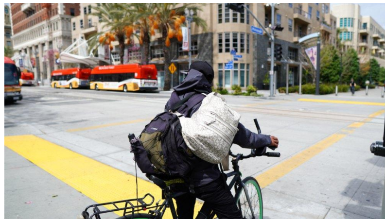
You can't see it from here, but he was wearing some protective gear while he was traveling the area. Taken at the Bus station in Downtown.