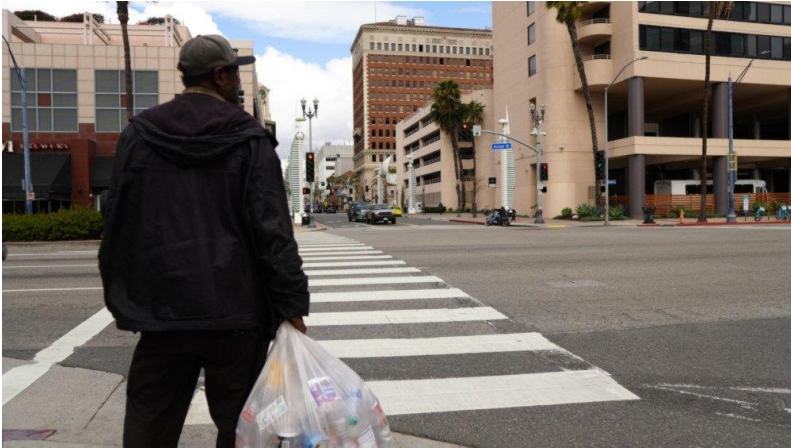
A man after a round of hunting bottles for recycling. Taken near The Pike.

The threat that this virus has posed to the homeless is extreme — many of whom are weak and frail due to the harsh conditions of living in squalor each night. Luckily with the support of many local organizers in the States as well as my city, Long beach, have helped reach out to the homeless and provided them with food, supplies and temporary shelter as the cases of homelessness ramp up in the States.