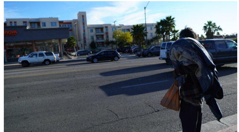
A homeless person asking for change by the side of the curb. Taken next to Yoshinoya at Willow and Atlantic.

Mainstream media has been lacking in covering the issue that homeless people face. There are more than eighteen thousand homeless people attempting to take shelter and surviving, and the situation is critical in ensuring that they're not forgotten in this human right conversation.