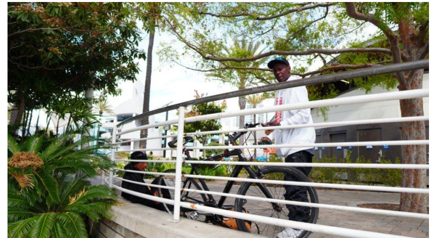
Although I am not sure if the one of the right was homeless, the one of the left surely was since they were discussing having issues finding food and money with the other homeless being next to the Long Beach Convention Center