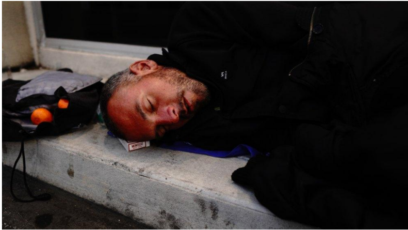
A Homeless man sleeping with a cigarette carton as a pillow. Taken near Los Altos Park in East Long Beach.