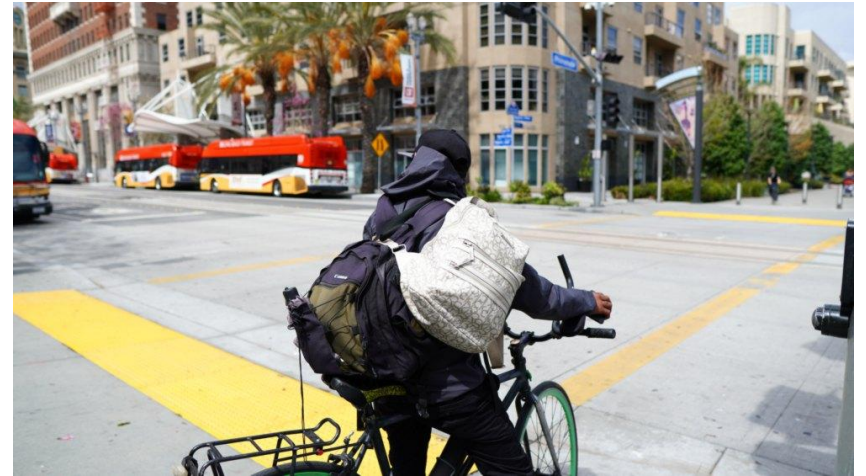
You can't see it from here, but he was wearing some protective gear while he was traveling the area. Taken at the Bus station in Downtown.